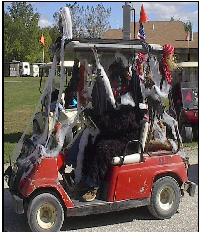
Kevin West from Blk. 5, Lot 72. Congrats Kevin!