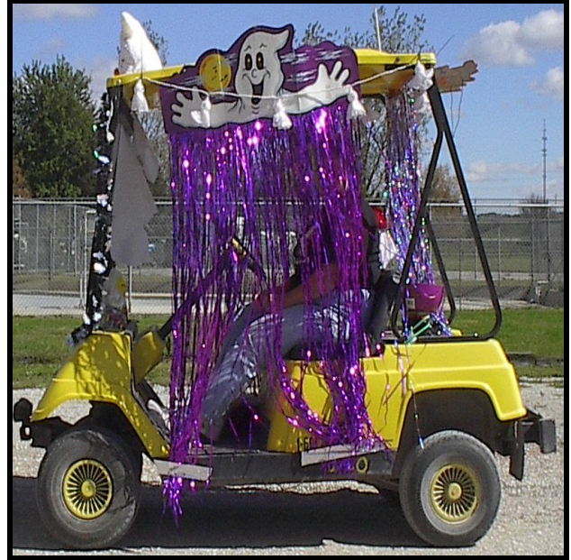
Georgia Metzger, Blk. 1, lot 60 took second place in the golf cart contest. Good going Georgia!